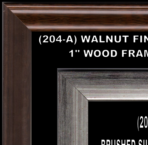
(204-A) WALNUT FINISHED 1" WOOD FRAME